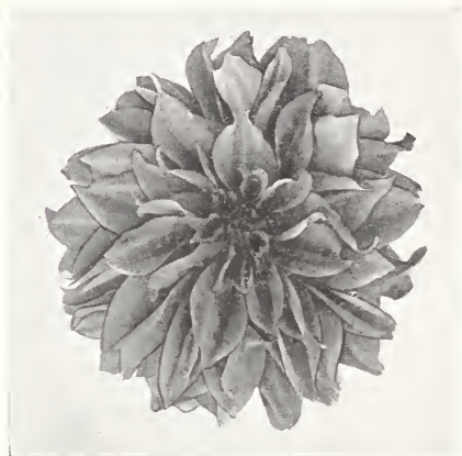
N. C. 4